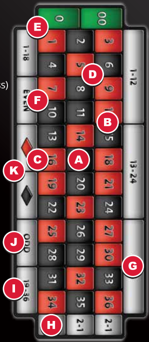
the diagram indicates various bets and their odds